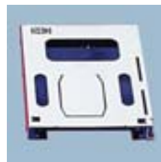
4-in-1 Combo Connector